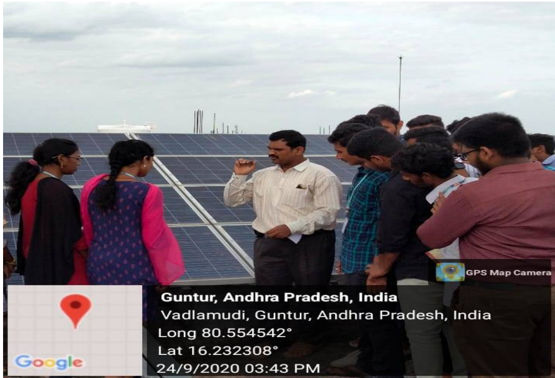
Awareness Program on Green Energy