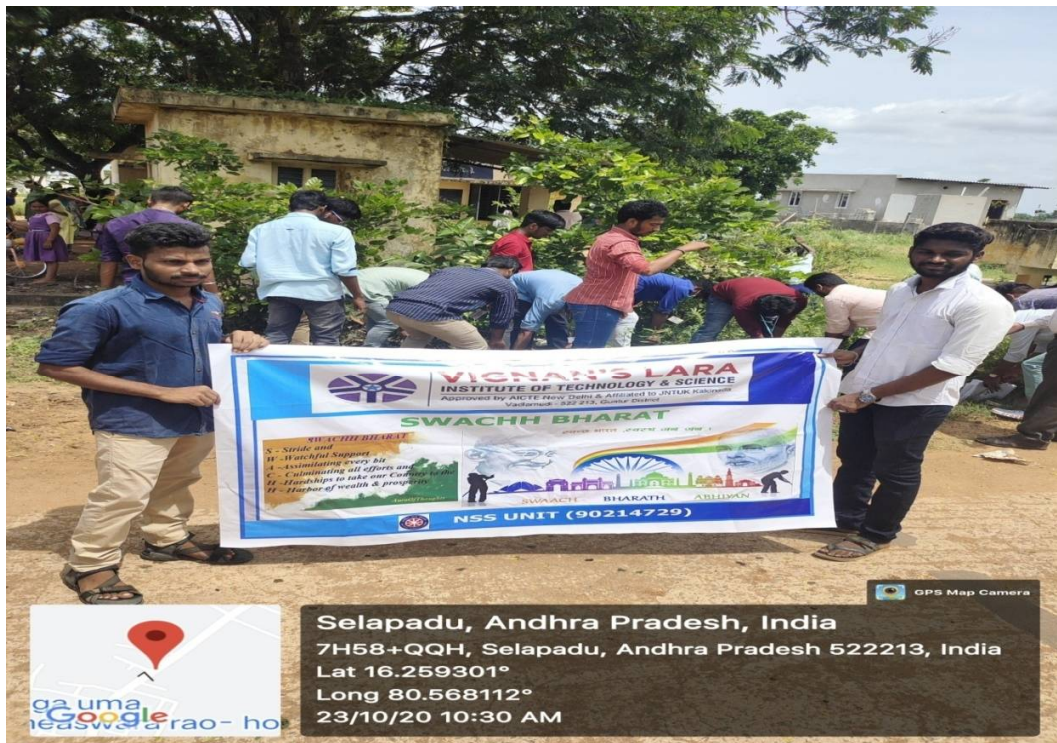
Cleaning activities at Selapadu