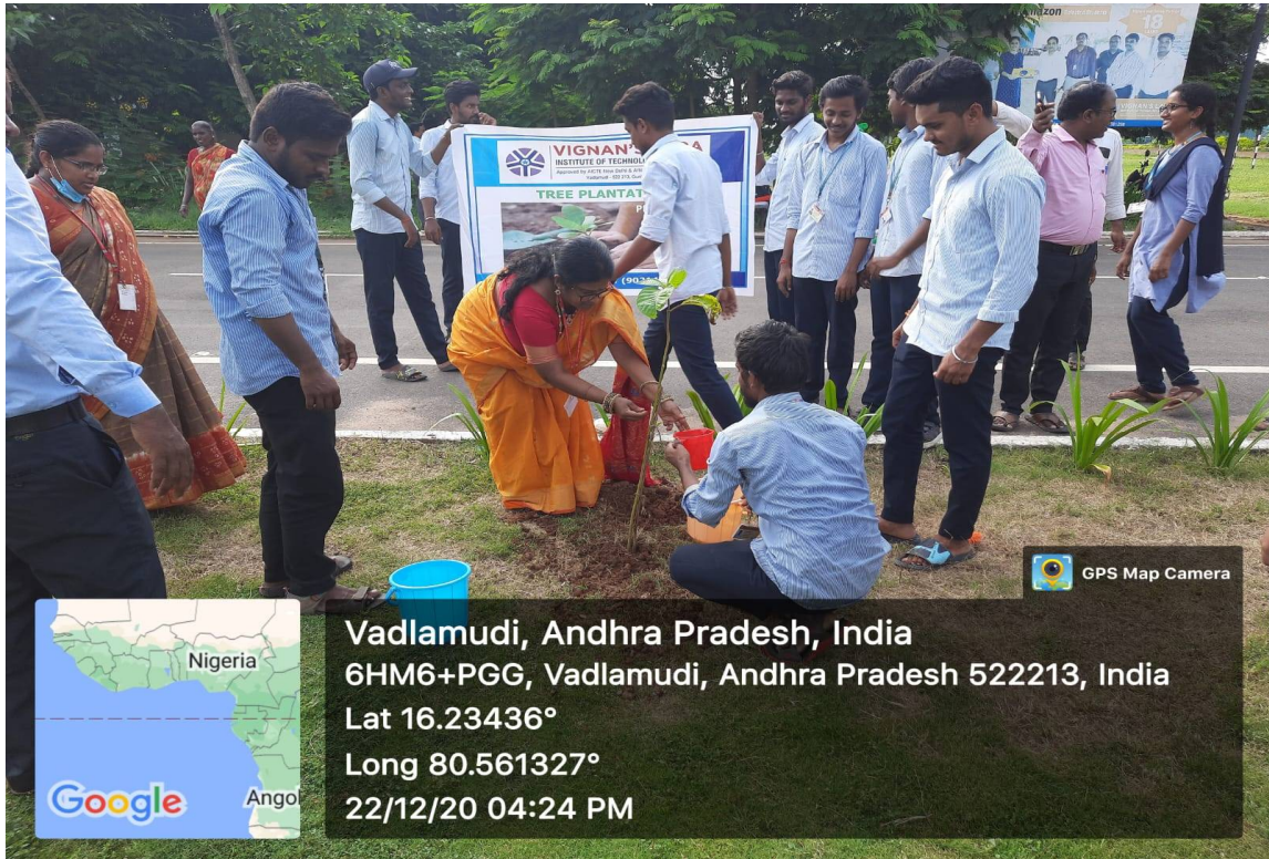
Tree Plantation Program