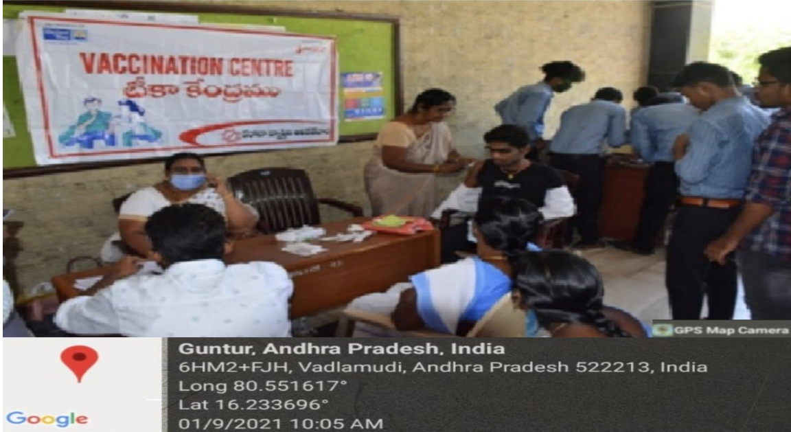
COVID-19 Vaccine campaign