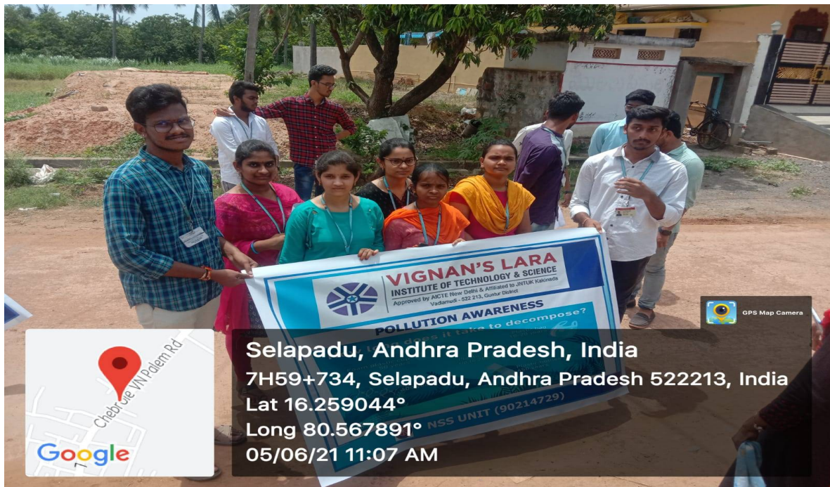
Water Pollution Awareness Program